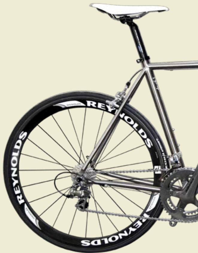
Bike shown with custom kit.