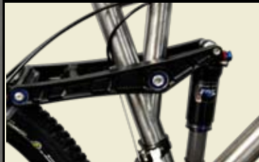
Merlin four-bar linkage technology provides optimum pedal power efficiency

Featuring a full 5 1/4" of rear wheel travel, the Fox RP23 shock will smooth out any terrain. The titanium front triangle is designed to optimize the ride quality and handling on any trail. The uniquely shaped down tube adds strength, durability, and fork clearance for those who enjoy the way down as much as the way up. The 5.25 delivers exceptional performance for all day adventure in the mountains.