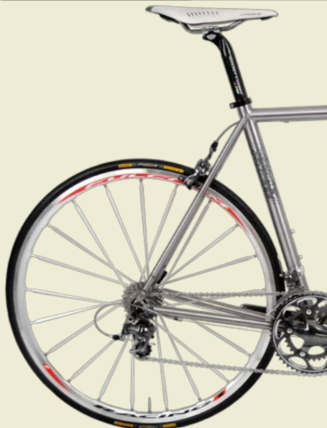
Bike shown with custom kit.

Elegant engraving that you expect from Merlin.