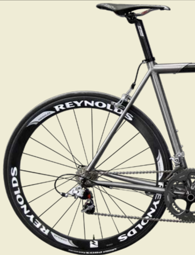
Bike shown with custom kit.