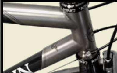
Engraved lugs and head tube