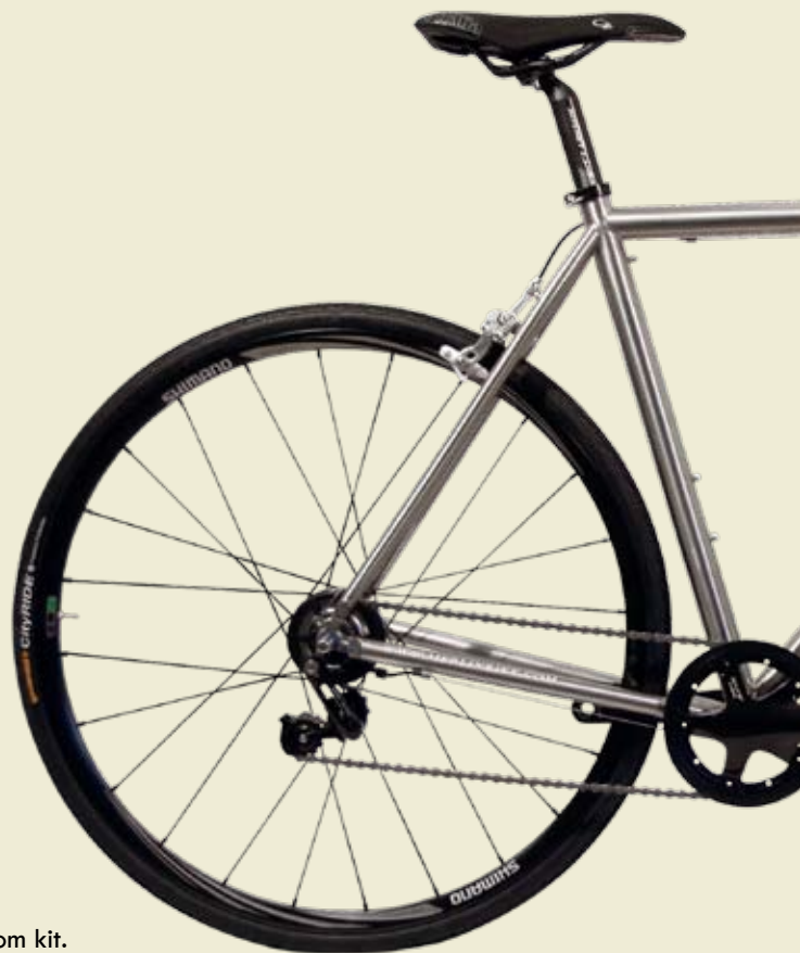
Bike shown with custom kit.