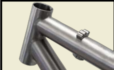
Double-butted top and down tube